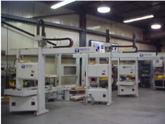
Some of our inventory!

For immediate information on this offer or any other automation project that you need assistance on, please contact: